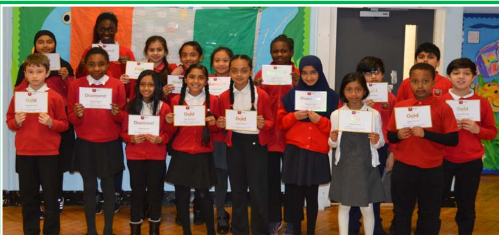
New City Mathematicians All these children have received Gold or Diamond Awards in the Times Tables Challenge –Well Done!